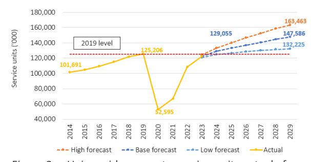
Figure 2 — Union-wide en route service units actuals from 2014 to 2023, and STATFOR February 2024 forecast from 2024 to 2029.<sup>3</sup>